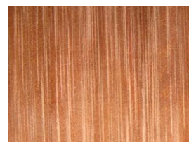
Red Cedar *