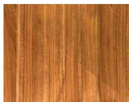
Spotted Gum *